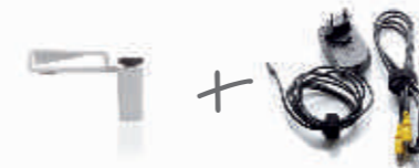
Cable stop D502007 Keeps cables neatly together. Stops cables slipping from desk tops. Fits all desktop thicknesses between 13 and 30mm.