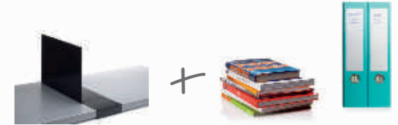
Book support D502012 Holds binders, books and other documents in place. Easy to reposition on the shelf and personalise with magnetic label holders.