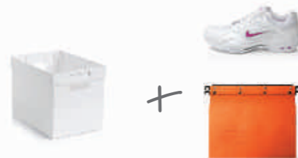
Box D502005 Mobile and flexible organisation. No prescription in terms of use: suspended files, cables, shoes, laptop. Limits clutter in the bottom shelf of cupboards. Easy to personalise with labelling.