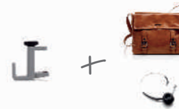
Hook D502006 Portable cloakroom. Keeps bags within sight. Can also be used for telephone headband, keys, access cards. Fits on all desktop thicknesses between 13 and 30mm.