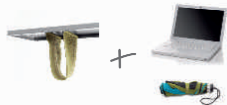
Suspended fabric folder D502014 Adapts to whatever the shape of the object stored... for general office and personal use. Fits also inside pedestals.