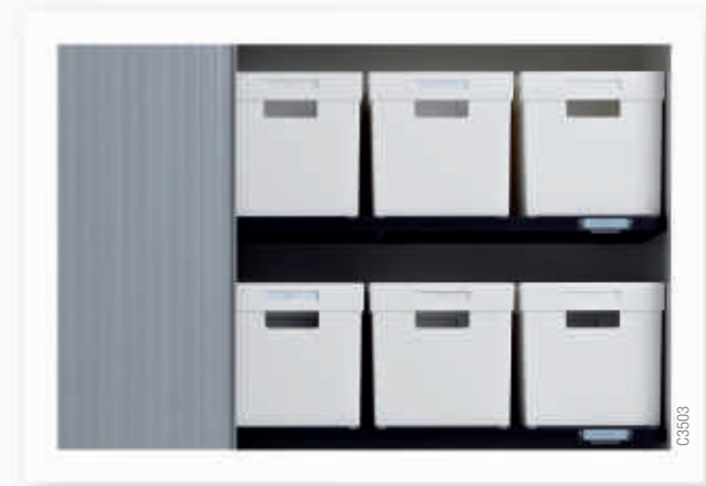
Archived seldom Information & objects infrequently accessed find their place in archived storage solutions.