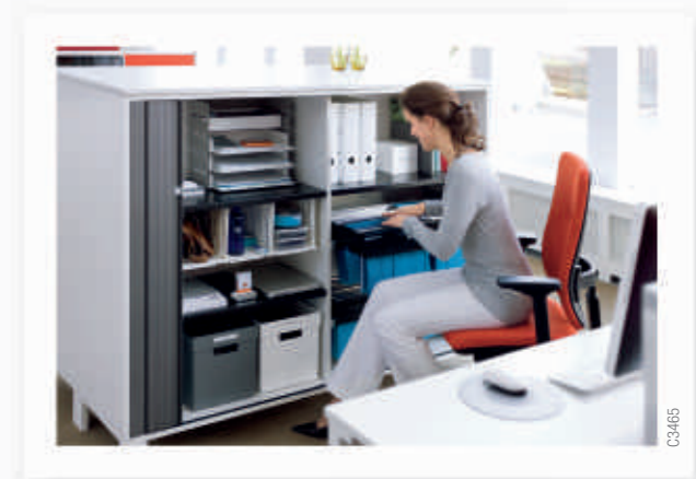
Anticipated at least once a week Material needed at least once a week, for referencing or work waiting to be done, should be kept at hand's reach, or close to the desk.