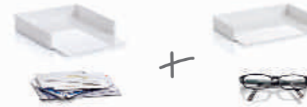
A4 Letter tray long D502002 /across D502001 Can be stacked, freestanding or affixed to orgarail or 1+1 freestanding orgarail, identification labels provided.

Better tools create smarter storage 43% of European office workers feel that they would benefit from increased storage space. But what if they just needed proper organisation tools? 1+1 Worktools offer a broad range of unique and versatile solutions for storing and organising. By helping users make more efficient use of existing storage units and space, these can reduce the need for increases in capacity.