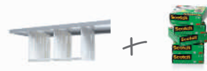
Foldable shelf (2/3 compartments) D502013/ D502016 Space optimisation in between shelves. Compartments for paper supports, envelopes, forms, stationery, cables, food...