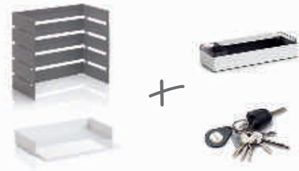
Freestanding Orgarail D502010 Inside storage, on-top or seated on a desk. Visible or hidden. Use vertical free space and keep documents and daily tools close at hand.