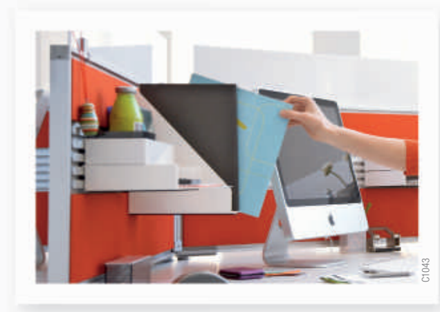
Active material is used daily It must be kept visible, above or at the desk.