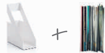
Binder Holder D502003 A solution for vertical filing of binders, magazines, books or files. Can be used inside a cupboard, on a desk or hung on an orgarail. Identification labels provided. Easy to handle.